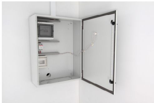
Interior view of shelter enclosure.